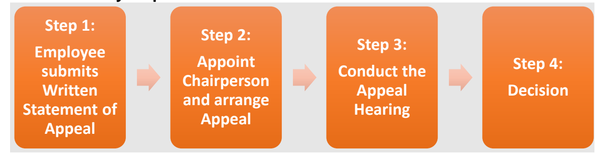
Step 1: Employee submits Written Statement of Appeal

Where either party is dissatisfied with the outcome, an appeal may be made to their Director. The statement of complaint form found at appendix 4 can be used for this purpose. The notice of appeal must be made in writing within 10 working days of receiving the investigating officer's written confirmation of their decision and must set out the grounds for appeal, demonstrating why they consider the decision to be unreasonable.